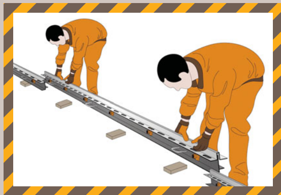
Positioning on the joint line.