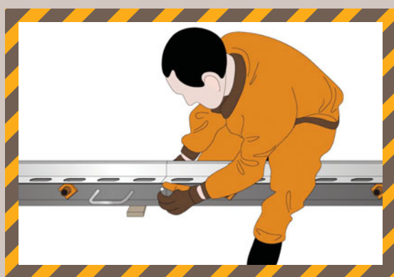
Installation with PVC screws.